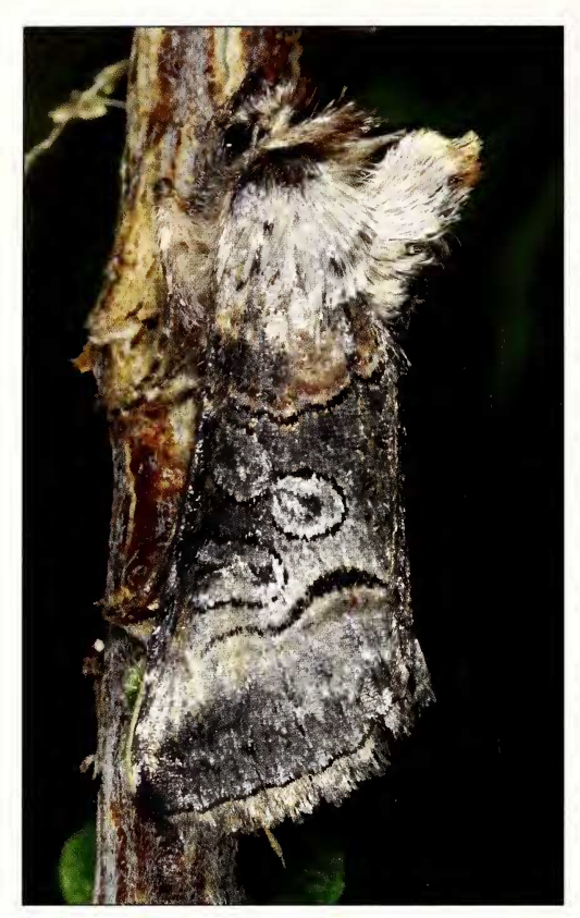
Fig. 1. Imago of Abrostola canariensis (La Gomera, Valle Gran Rey, December 2011).